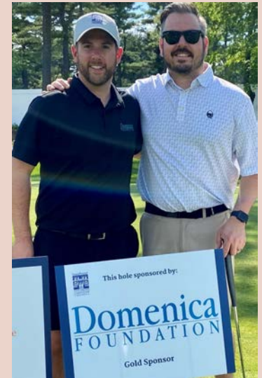
Golf outing for St. Joseph's Carpenter Society, which makes home ownership a reality for lower-income families