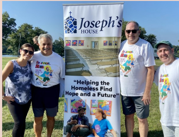
Walk to support Joseph's House, which provides shelter and comprehensive social services to the homeless