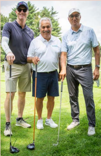
Catholic Partnership Schools golf outing

It was great to participate in outdoor summer events to support our partners!